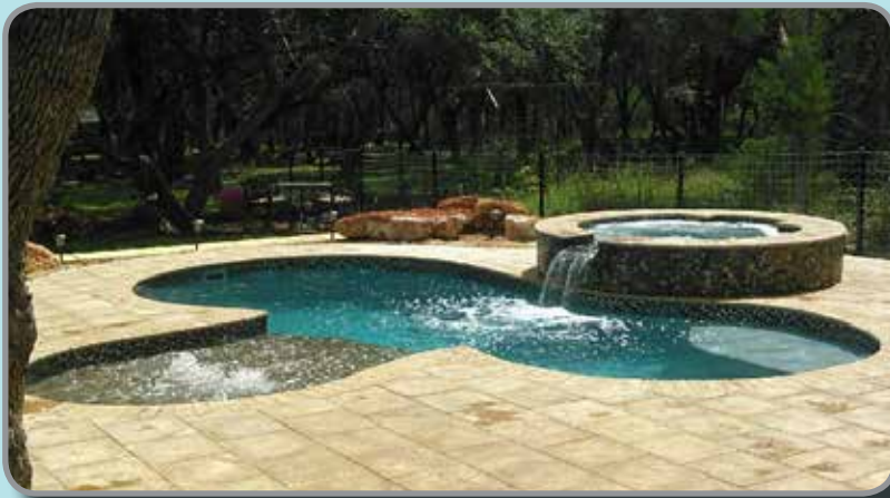
The Sundial model with the Isle Spa in Granite Finish